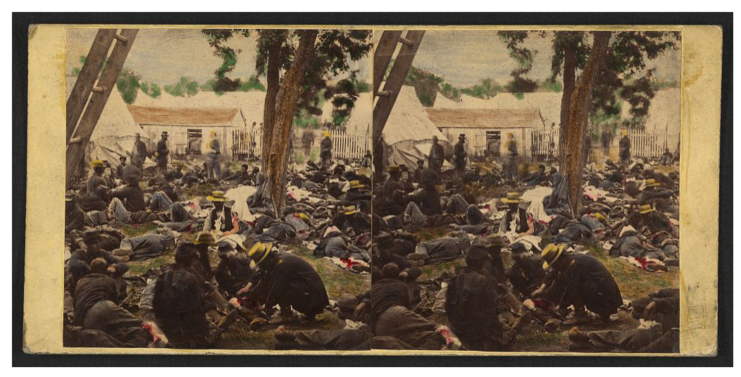
Tending the wounded at Savage Station, stereograph

CC.1.2.11-12.A, B, I; CC.1.4.11-12.A, H, I; CC.1.5.11-12.A, D, G; CC8.5.11-12.A-C, F, H; CC8.6.11-12.H