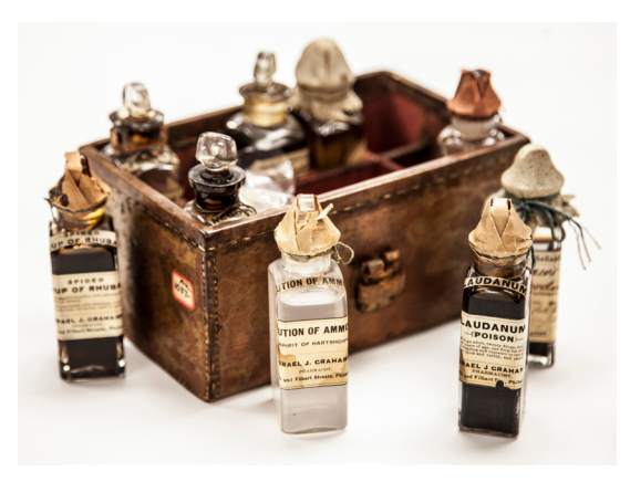
Civil War era medicine chest containing wax sealed vials of laudanum, morphine and other medicaments

• From the case studies below, describe how doctors treated their patients. Be sensitive to the ways doctors described their interactions with the patients and the details they noted about the patient's fatal condition.